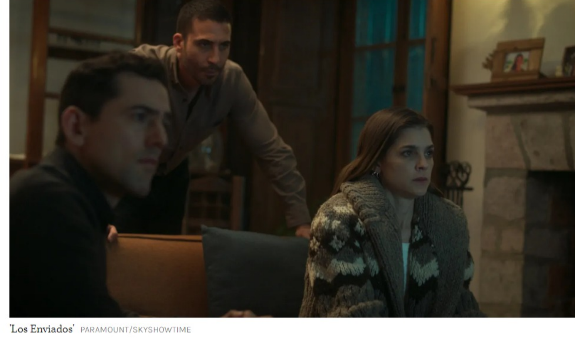
Los Enviados'