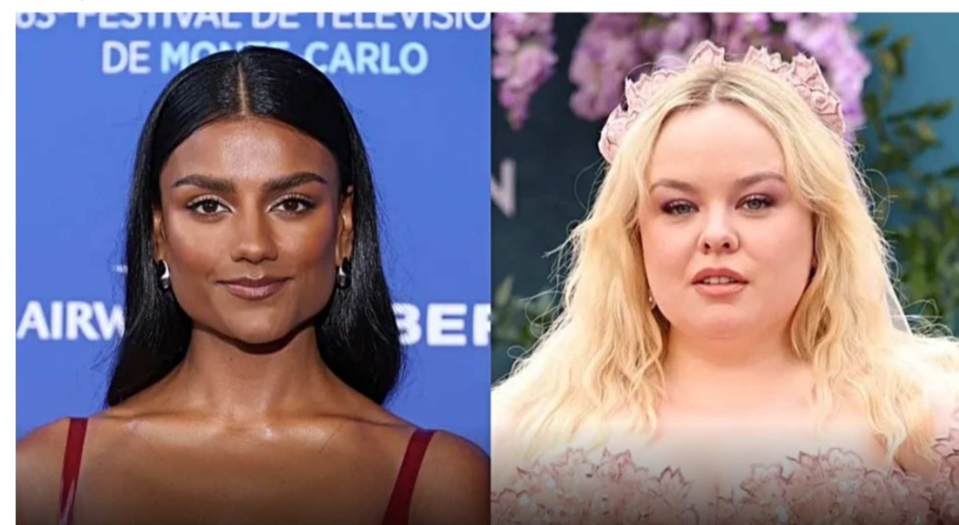
Simone Ashley Defends 'Bridgerton' Co-Star Nicola Coughlan Amid Body-Shaming Comments