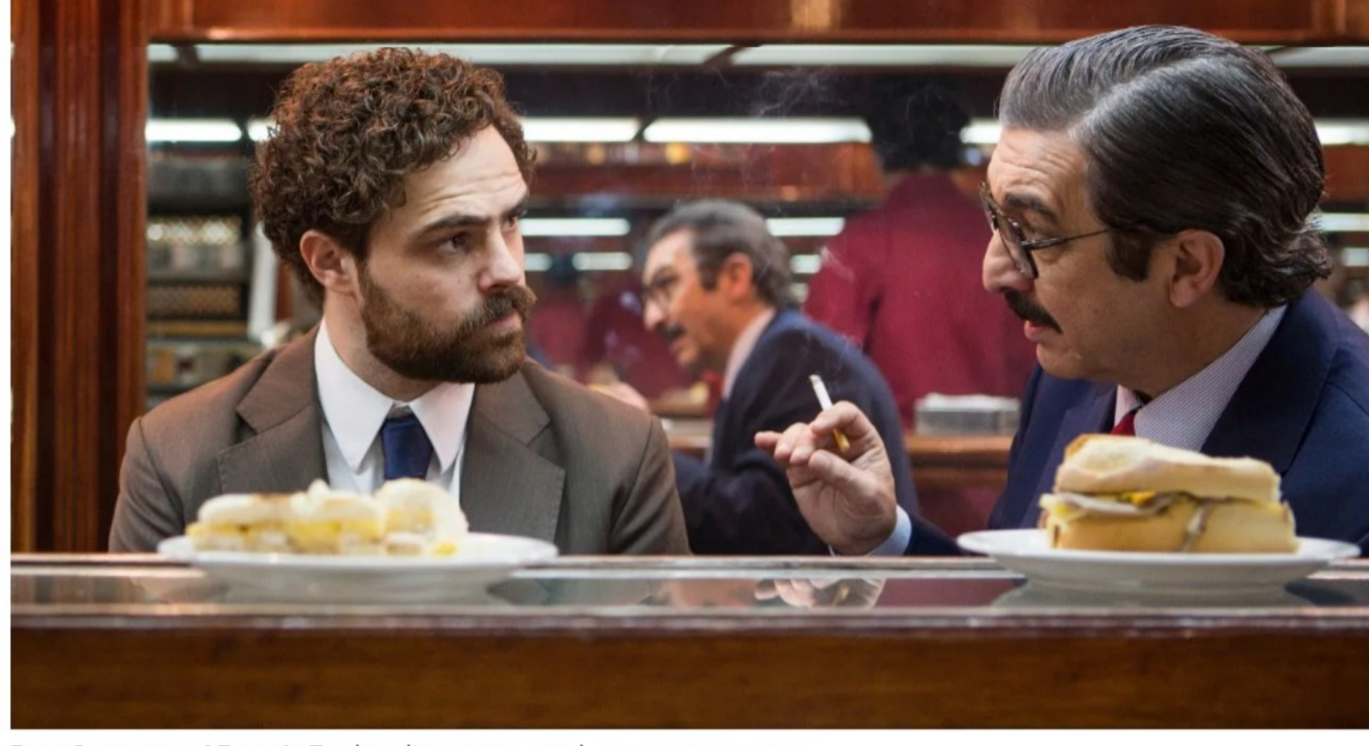
Peter Lanzani and Ricardo Darin in Argentina, 1985.

Amazon's Latin America branch is going full steam ahead with its true crime projects.