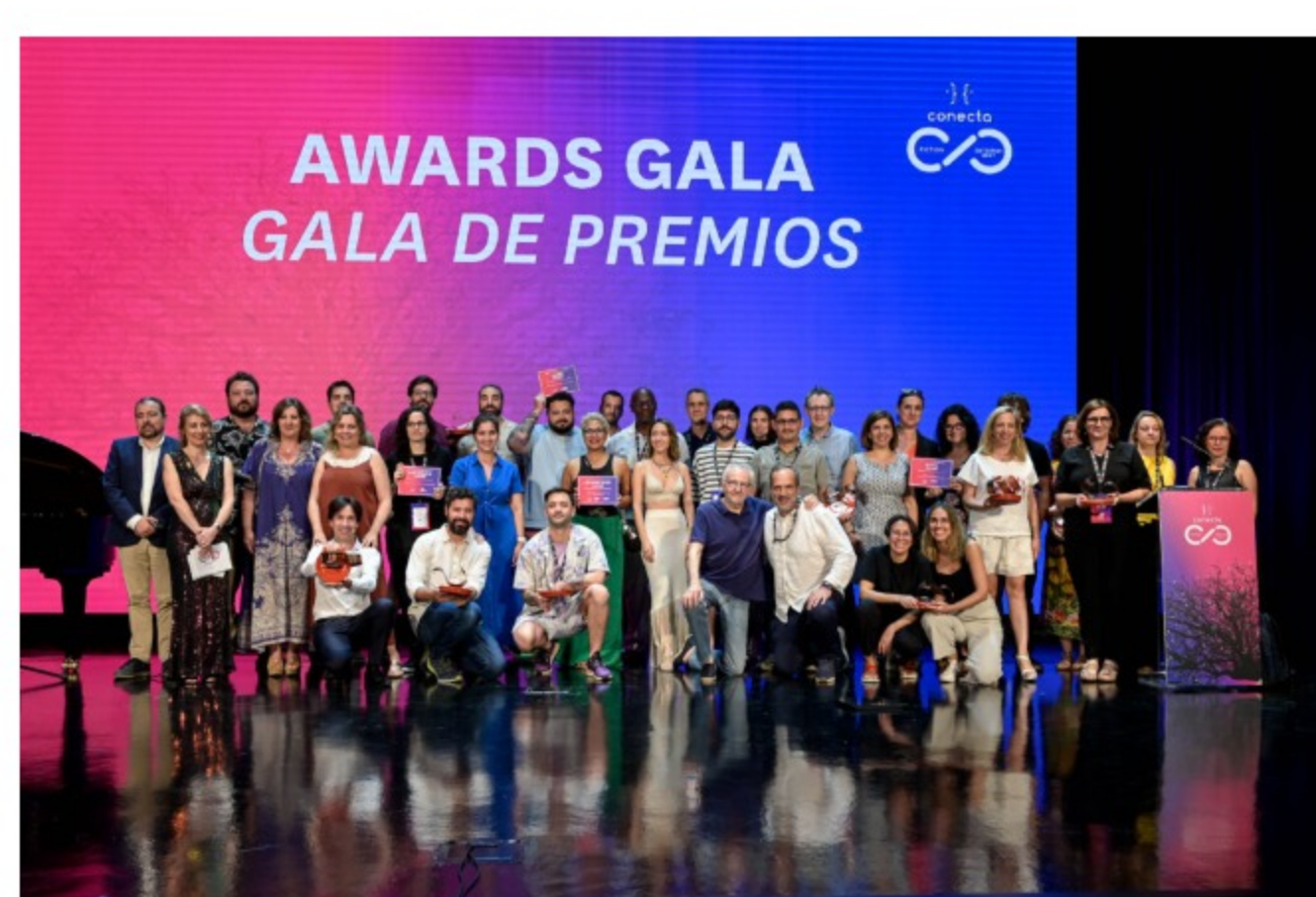
Awards ceremony at the 2023 Conecta Fiction & Entertainment