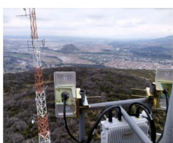
May 9, 2024 Wireless and wired networks: The perfect symbiosis in the era of intelligent connectivity