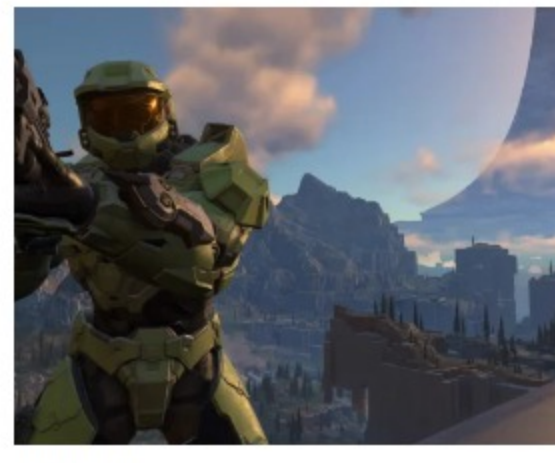
April 3, 2024 Phil Spencer, CEO of Gaming at Microsoft, explains why there are so many layoffs in the video game industry