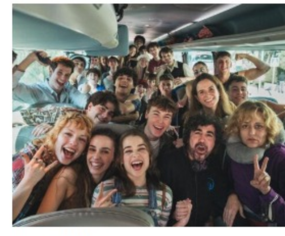
February 16, 2024 Zeta Studios' 'End of Course Trip' begins filming