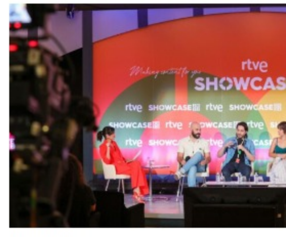
March 5, 2024 The RTVE Showcase to announce its news will be held from May 8 to 10