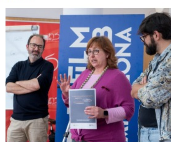
April 12, 2024 'Sustainable Guide for the Clueless', a PAC initiative