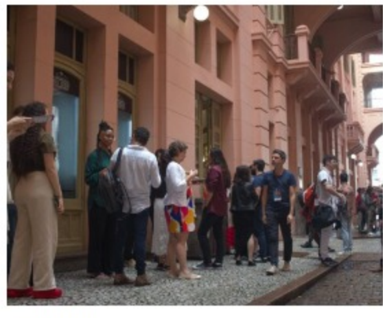
April 4, 2024 FRAPA opens project Pitchings to the public