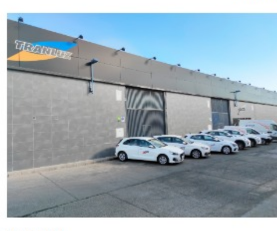
May 7, 2024 Tranluz, 35 years of experience offering a 360° service